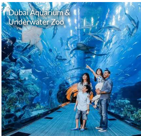
Dubai Aquarium & Underwater Zoo