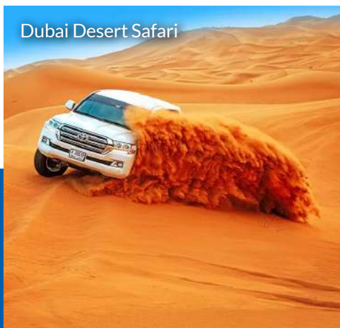
Dubai Desert Safari