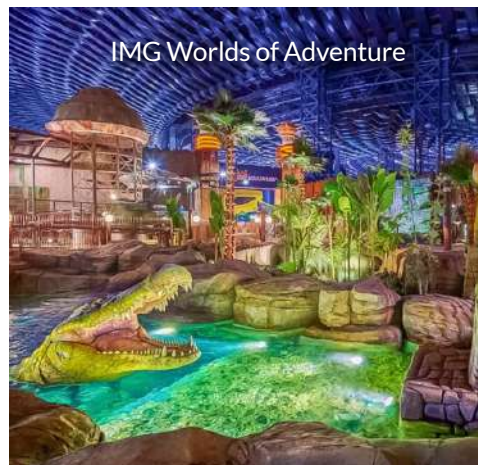
IMG Worlds of Adventure