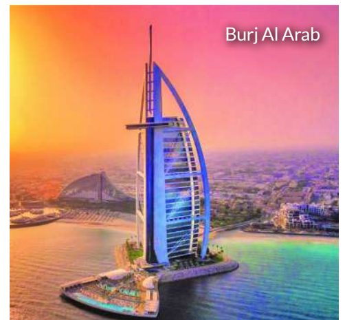
Burj Al Arab