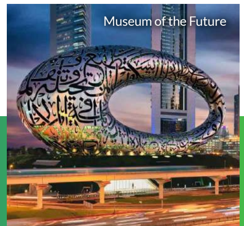
Museum of the Future

These are just a few highlights, as Dubai offers a wide range of attractions and experiences for visitors of all interests.