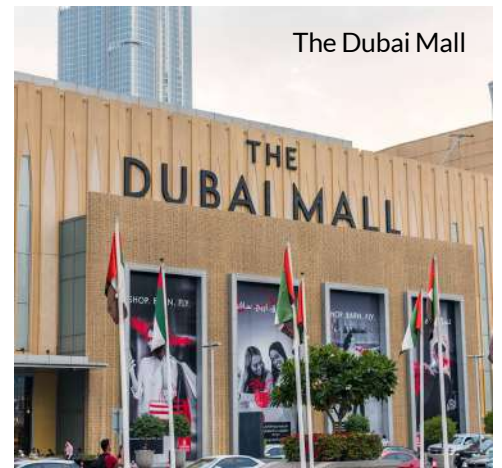
The Dubai Mall